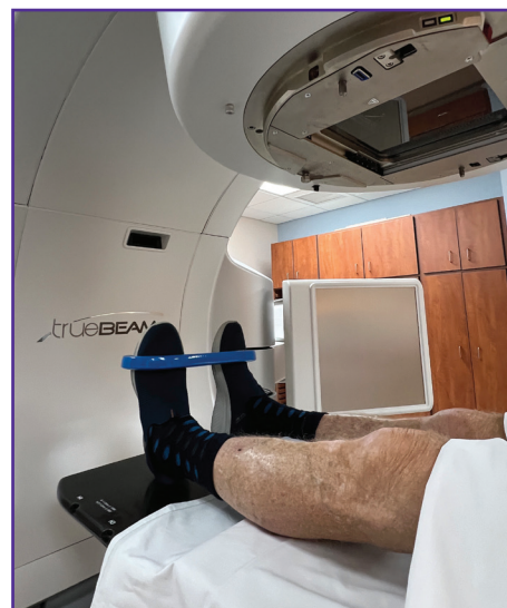
A patient receives radiation therapy for persistent knee arthritis at Shore Cancer Center

Programs like this one reflect Shore's commitment to advanced, patient-centered care, and are made possible by people like you. Thank you for helping us continue to provide new treatment possibilities, close to home.