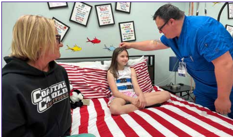
Shore's Center for Sleep Medicine has expanded to include pediatric sleep studies for children ages 3 and up. All sleep rooms in the Sleep Center have been renovated, including this child-friendly Dr. Suess-themed room.

Since 2006, Shore Medical Center has cared for adults with sleep disorders at its Center for Sleep Medicine, and now, through the generosity of our donors, we've expanded services to include pediatric sleep medicine. Through a new partnership with Advantage Sleep Centers, we're helping children ages 3 and up get the rest they need for healthy growth, learning, and development.