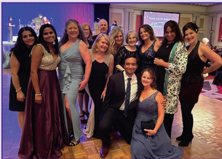
Members of Shore Cancer Center’s Medical Oncology team enjoyed a night out together at the Oct. 14 gala, where they were honored.